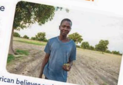
A West African believer and subsistence farmer.

This story of persecution among the Wassulu people is one of many that are unfolding around the world right now. We must unite in prayer for our persecuted brothers and sisters.